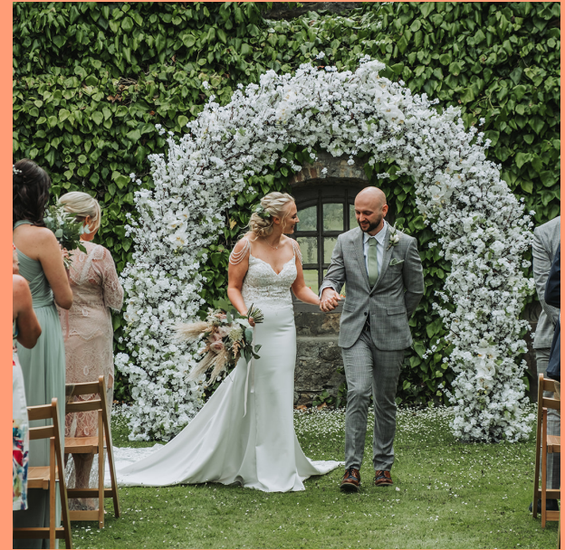
Luxury White Blossom & Orchid Arch